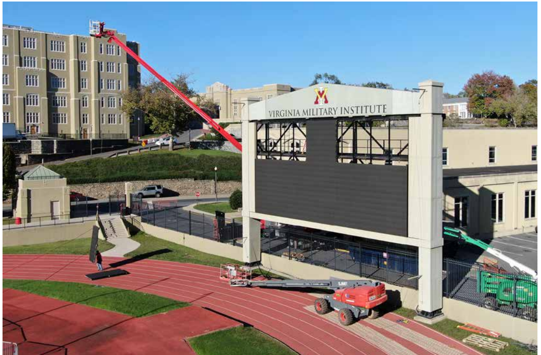
Piros Signs of St. Louis, Missouri installs a 10mm videoboard to replace the Foster Stadium scoreboard.

Just down the street in Foster Stadium a new videoboard was installed in mid-October. The previous scoreboard was installed in 2006 and displayed a 23mm pixel pitch. The new videoboard will display a 10mm pixel pitch as well as live statistics