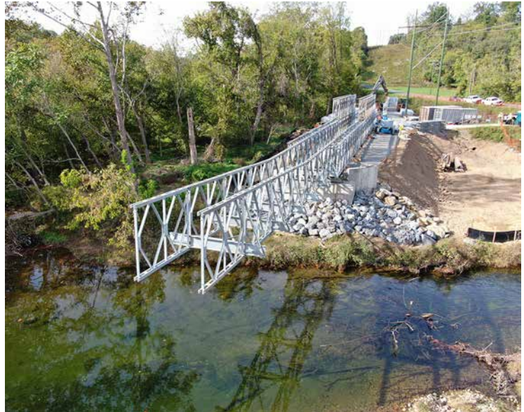
The frame of the Chessie Nature Trail footbridge arches almost halfway across South River as of Oct. 14.

local municipalities, began in December 2020. In mid-October, bridge assembly was taking place onsite, and the full bridge was pushed across the river in two phases. Contractors then focused on adjustments to the grade on both sides of the river, finishing with clean up and adding a parking area. 🌲