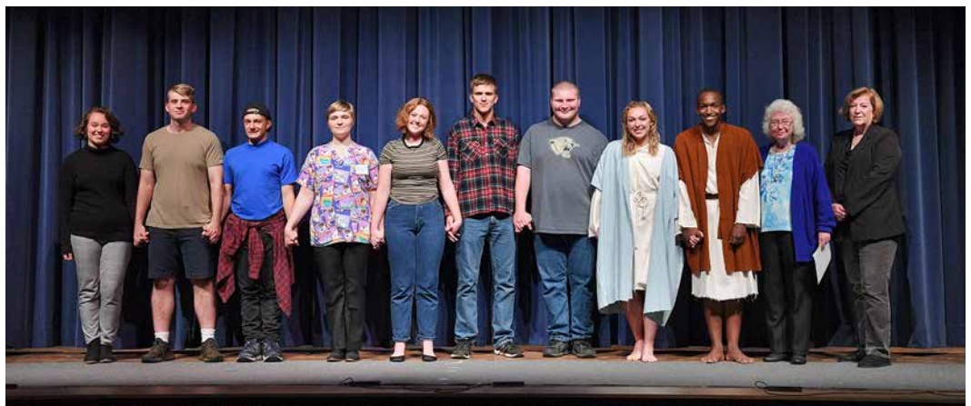
The cast of "It's a Theater Thing" pose for a photo after the Oct. 10 performance in Gillis Theater.