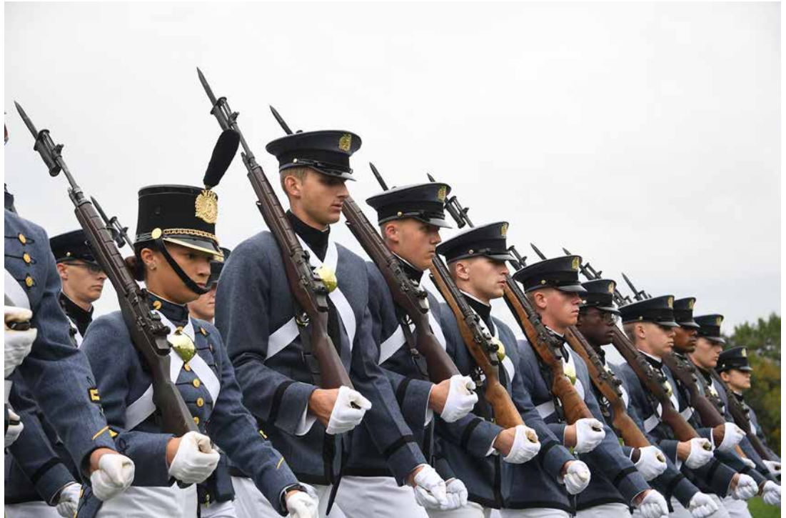
Cadets march in the Family Weekend parade Oct. 9.

Saturday morning was misty and cool, but that didn't stop the parade on the Parade Ground and tailgating at McKethan Park, located about five minutes from post. Family members were also welcome in a barracks open house. The Keydet football team then put on a show for a large crowd in Foster Stadium, coming off the tough loss at the Citadel the weekend before. The skies cleared and the momentum stayed