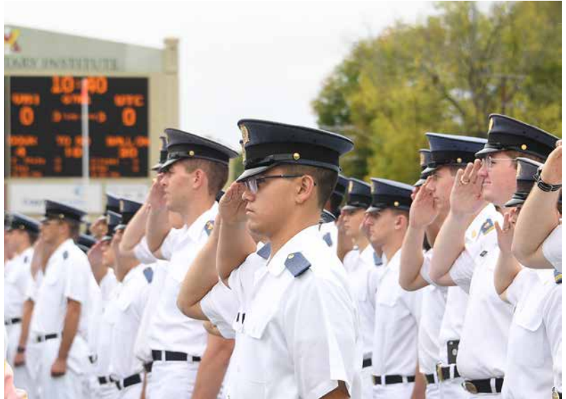
Cadets salute during the National Anthem in Foster Stadium just before the Oct. 9 football kickoff.