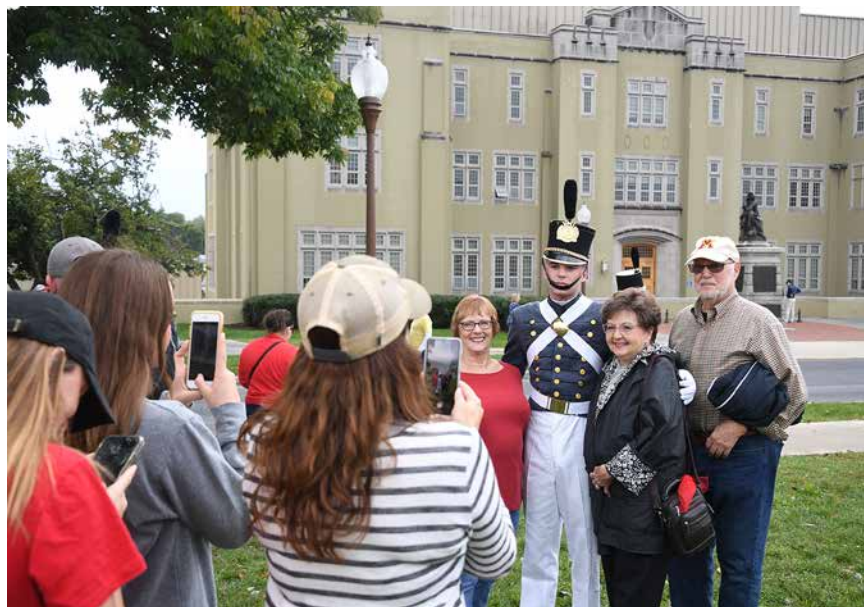
Friends and family members capture photos with cadets while visiting post Oct. 9.

“That face to face contact with other families of VMI was