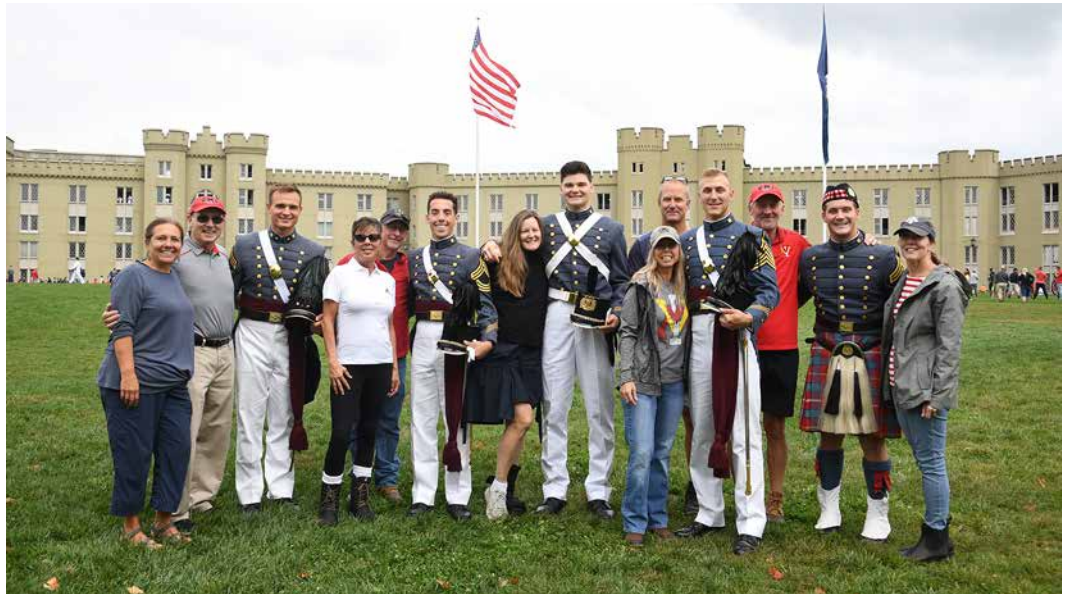
Cadets pose with their friends and families after the parade Oct. 9.

Several religious services were held on Sunday morning in Memorial Hall, followed by another women's soccer home game against Mercer. ❁