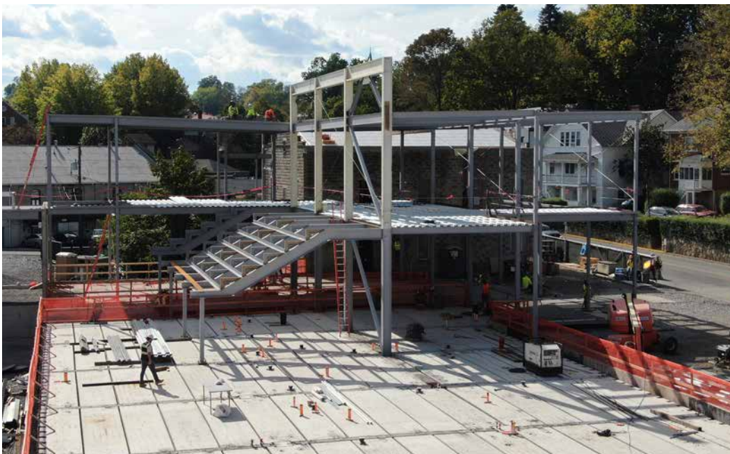
Construction workers assemble the steel frame for interior portions of the Aquatic Center located on Main Street.

Users of the Chessie Nature Trail will also be pleased with recent updates. Runners, walkers, and cyclists have been using a detour onto Stuartsburg Road since 2003 when the footbridge over South River was washed away by Hurricane Isabel. Completion of a new bridge this November will keep people on the trail. The $2.1 million project, funded primarily through a grant from the Federal Highway Administration along with VMI funds and funds from