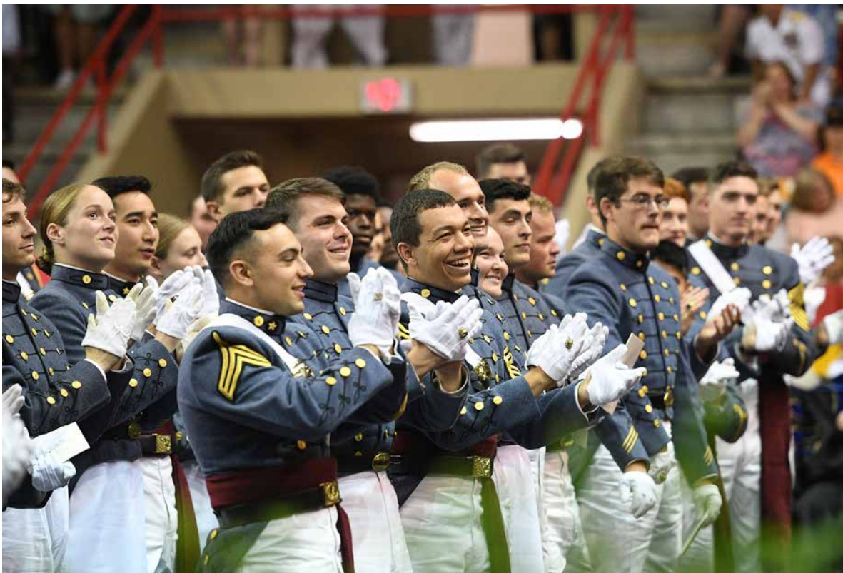
Members of the Class of 2022 show their excitement during the ceremony on May 16.