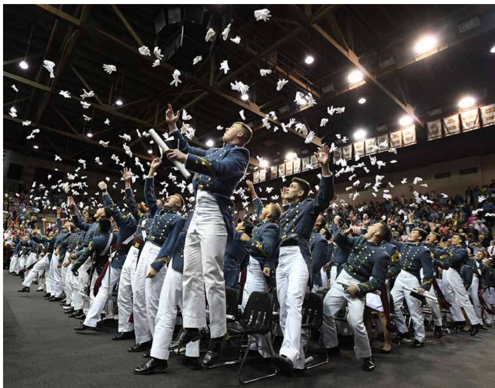
Members of the Class of 2022 toss their gloves in the air after being dismissed from duty and finishing their tenure at VMI.