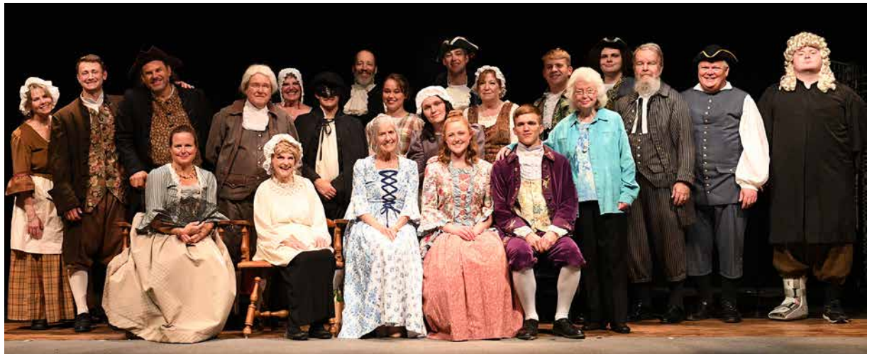
The cast of “Tom Jones” poses together after the April 30 performance in Gillis Theater.