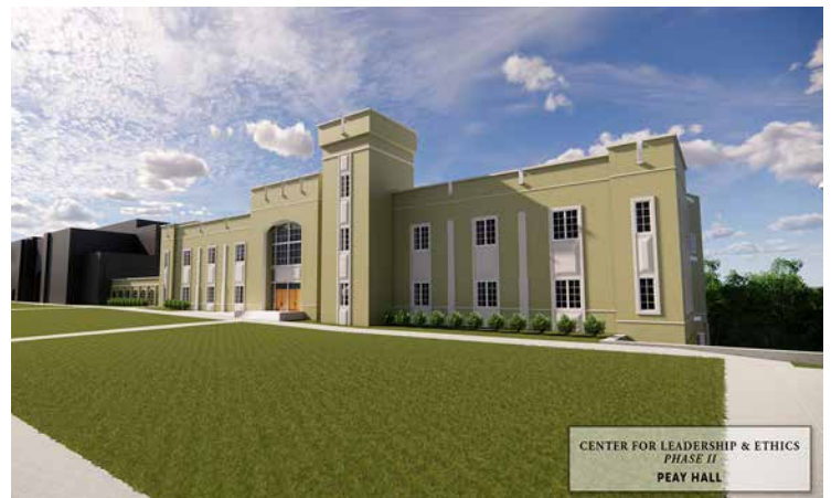
A rendering of Peay Hall.