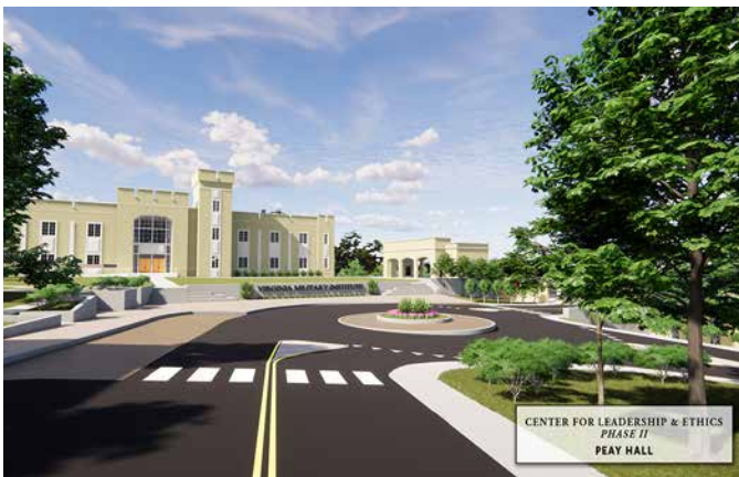
A rendering of the entry to Peay Hall to be located adjacent to Marshall Hall.