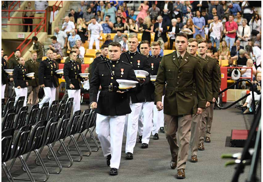
Cadets commissioning into the armed forces march into Cameron Hall for the joint commissioning ceremony on May 15.