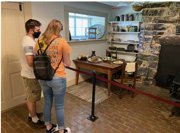
Visitors progress through a self-guided tour at the Stonewall Jackson House in early October.

The Stonewall Jackson House is open Thursdays through Mondays from 9 a.m. to 5 p.m. through the rest of this year. The house is closed on Tuesdays and Wednesdays. ❁