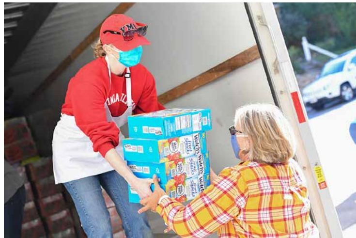
Mothers of cadets unload fruit snacks and other treats for care packages outside the Corps Physical Training Facility Oct. 3.