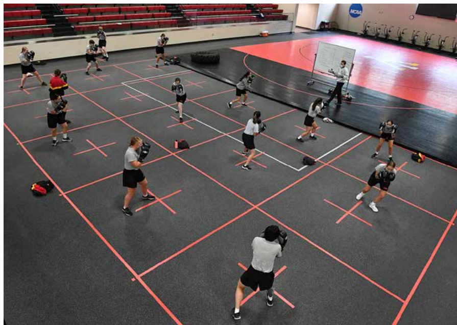
Cadets stay within their assigned 10-foot squares during a boxing class in Cormack Hall.

As the semester has progressed, Coale has observed that cadets have more fluid, natural