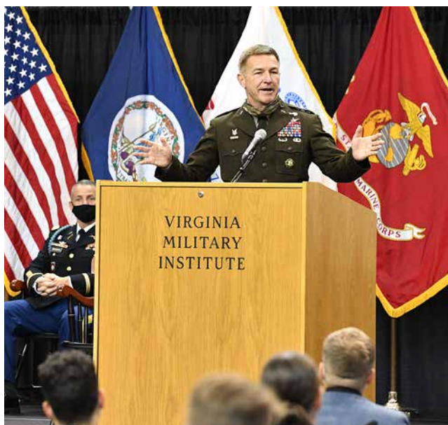
Gen. James C. McConville speaks in Cameron Hall Sept. 30.

McConville, who succeeded Gen. Mark Milley as chief of staff in August 2019, took a conversational tone with cadets, stressing the importance of putting people first and taking care of them as one of the primary ways to become and