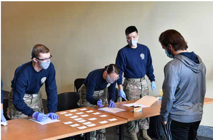
Cadets EMTs check in a prospective cadet during the first admissions open house Oct. 3.