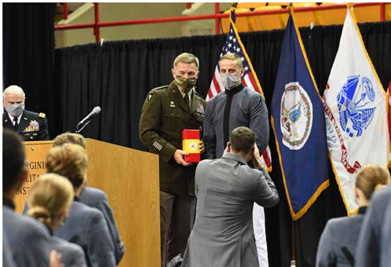
Gen. James C. McConville receives a gift from the Corps of Cadets during his visit to VMI Sept. 30.

Cadet questions for McConville were numerous and wide-ranging. More than one cadet asked the chief of staff about managing mental health in a pandemic, and McConville echoed a theme he’d