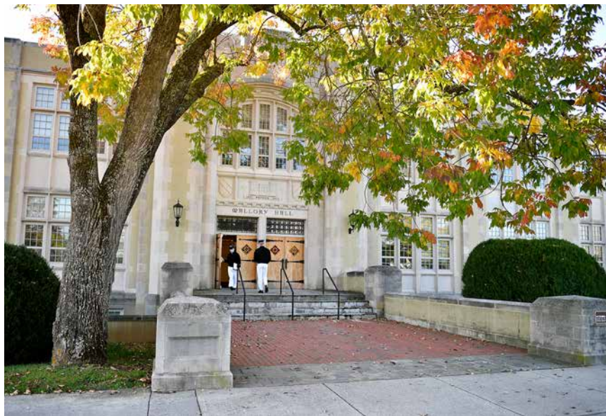
Mallory Hall, home to VMI's Department of Computer and Information Sciences, will soon house VMI's cyber defense lab.

As part of this grant, VMI will establish its cyber defense laboratory in the spring of 2021. The lab comprises two interrelated programs: the leadership-integrated competency development program and the immersive and experiential learning program. The vision is to provide premier cybersecurity leadership education, increasing the number of the next generation of leaders capable and ready to protect our nation from existing and emerging cybersecurity challenges. A priority for the lab will be to boost the representation of underrepresented groups in the cybersecurity workforce.