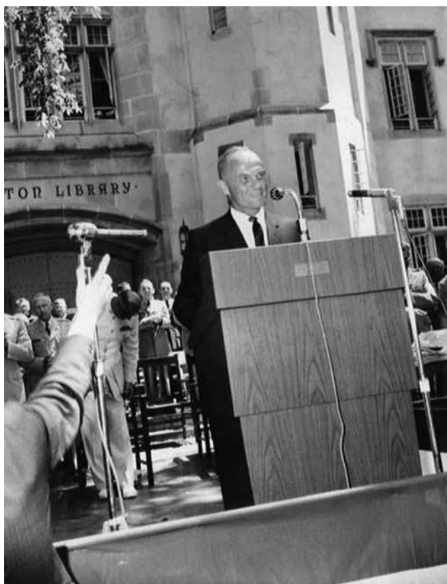
Astronaut John Glenn spoke at commencement for the Class of 1965.

Currently, the Archives' home on the 4 th floor of Preston Library is still under construction as the library undergoes its first renovation in nearly 25 years. Sometime this month, the Archives is