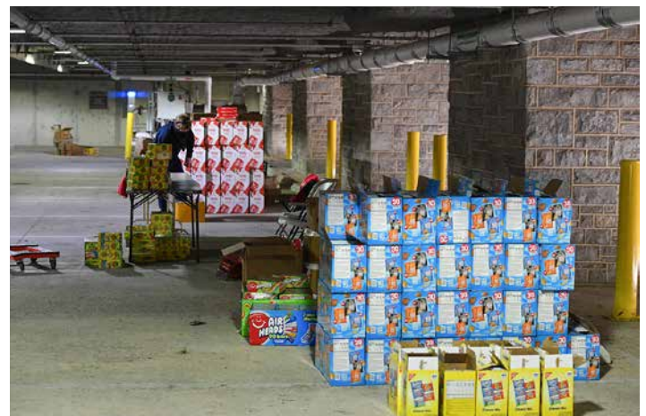
Boxes of snacks await packing in the parking garage of the Corps Physical Training Facility.