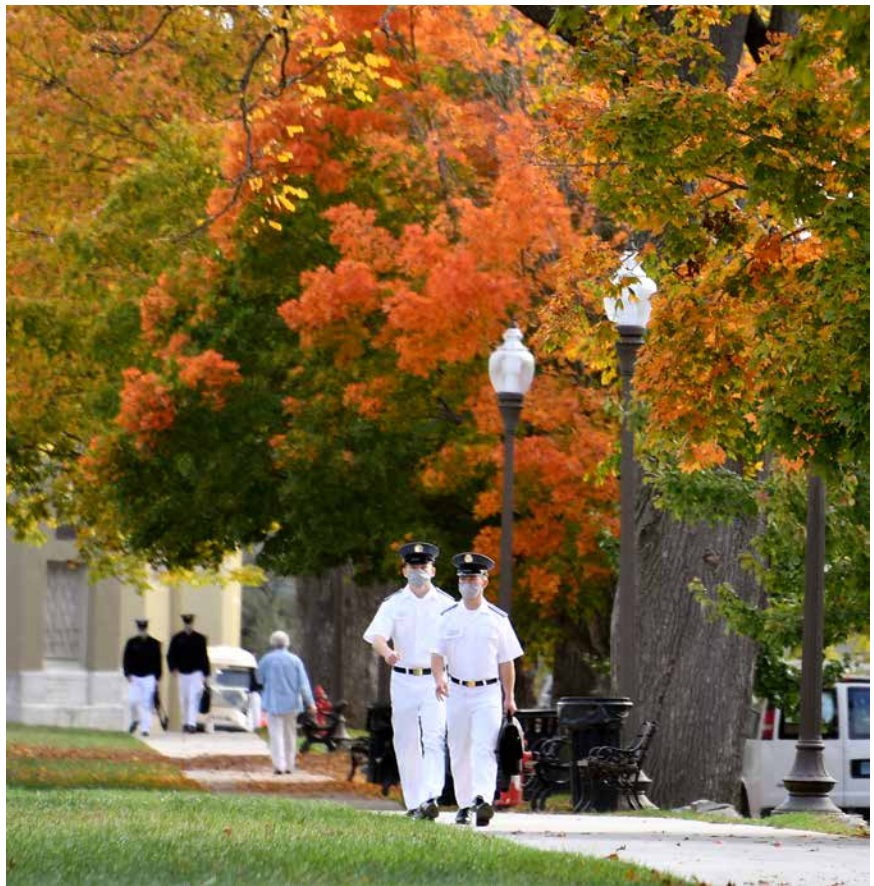
Cadets walk to class while wearing masks earlier this fall.

Additional information regarding cadet departure, the Class of 2022 Ring Figure, December commencement, cadet return, and support services for all of these events and activities, as well as details regarding refunds for fall room, board, and fees will be available at vmi.edu/fall-2020 . ❄️