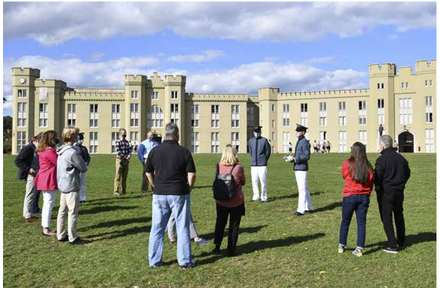
Cadets talk with prospective cadets and their parents during the Oct. 3 admissions open house.

This year, prospective cadets attend presentations in Marshall Hall, with socially distanced seating, and watch a parade by the Corps. Some take walking tours of post, but they are not allowed to