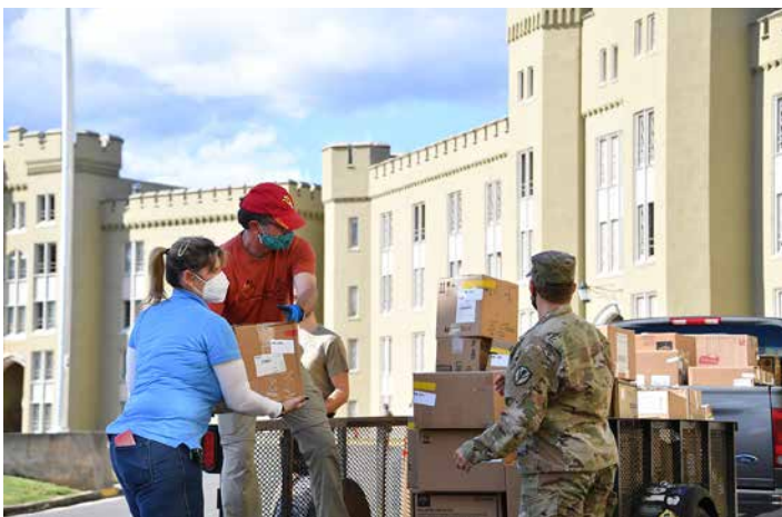
Parents and members of the cadet S7 staff unload care packages outside barracks.

“A lot of things got canceled for these [cadets], particularly for the rats,” she commented. “We want to keep the spirit of VMI going.” ❁