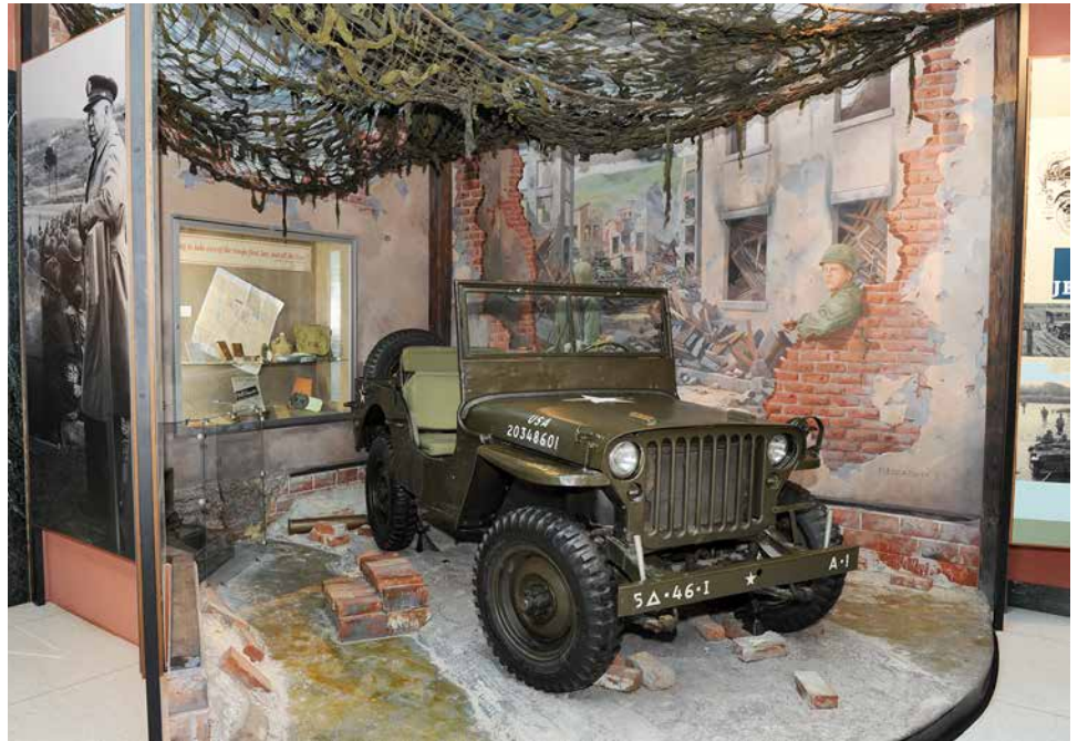
The Jeep that Gen. George C. Marshall, VMI Class of 1901, rode in during World War II was one of the Marshall Museum's most well-known attractions.