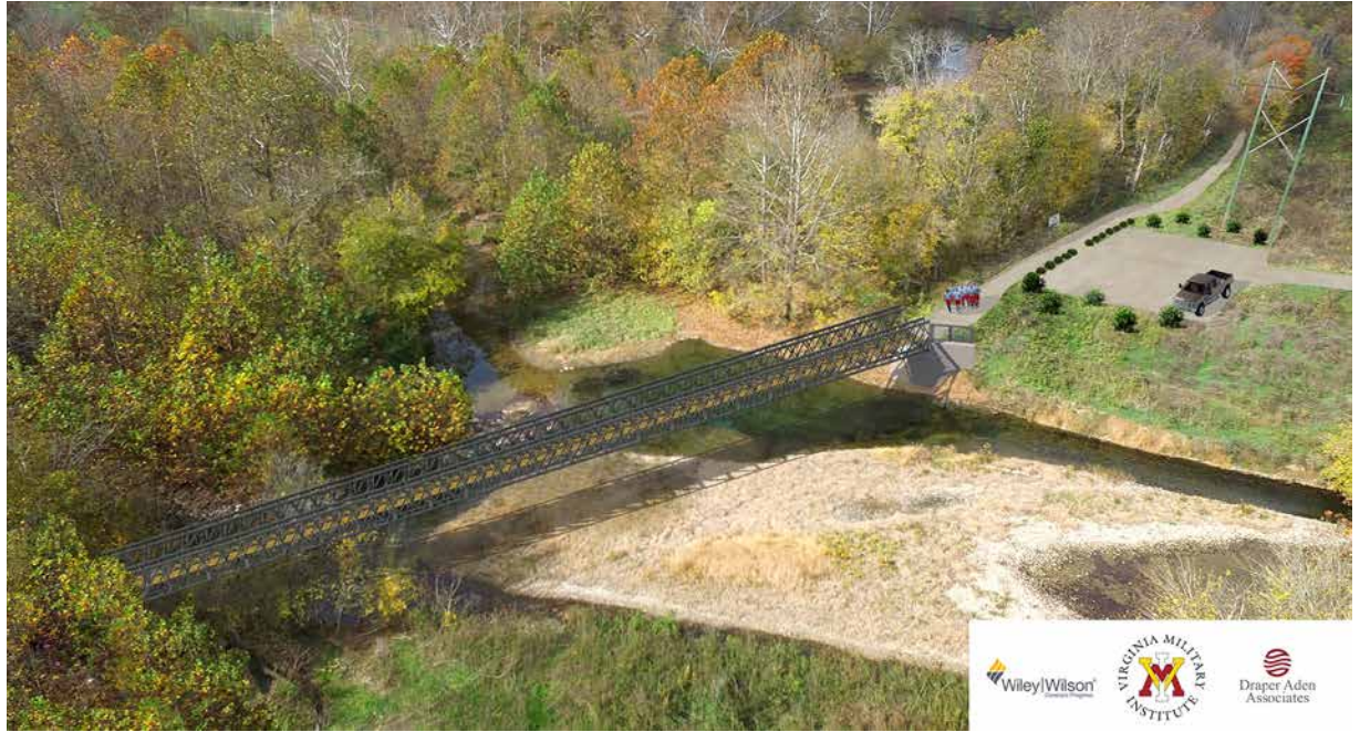
An architectural rendering shows the new bridge that will soon be placed over the South River on the Chessie Nature Trail.