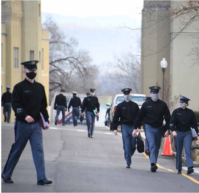
Cadets walk to class from barracks on the first day of the spring semester, Jan. 21.

As was the case during the fall semester, many facilities on post, including most athletic buildings, Preston Library, and the VMI Museum, remain closed to the general public. The Stonewall Jackson House is currently closed for the winter, with reopening set for March 1. The New Market Battlefield and the Virginia Museum of the Civil War are open seven days a week from 9 a.m. to 5 p.m. ❄️