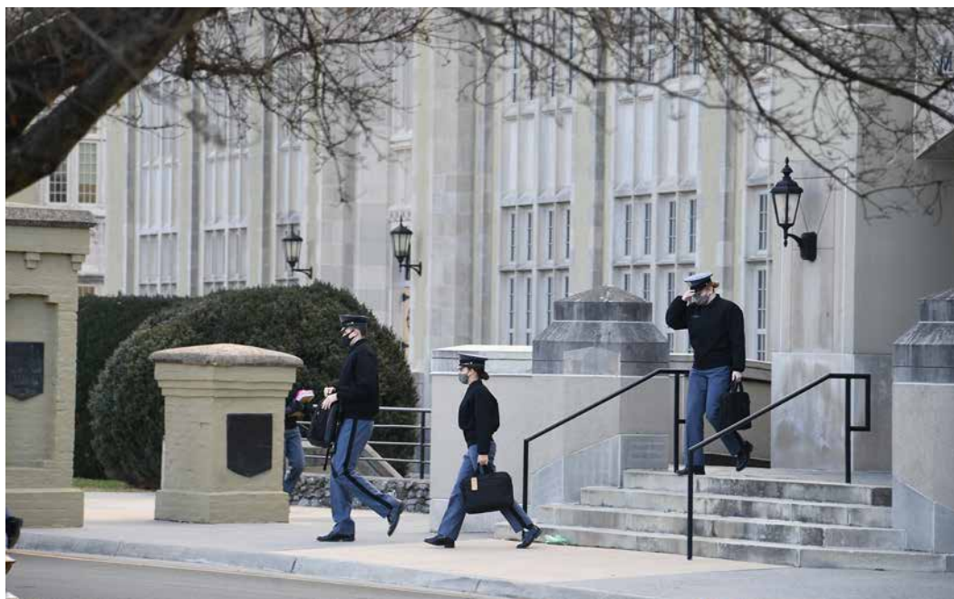
See Spring Semester, page 12 Cadets leave Maury-Brooke Hall on the first day of class, Thursday, Jan. 21.

To increase the safety of the VMI community, and that of the local community, cadet return was stretched out over a six-day period, and all cadets were tested for COVID-19 via the rapid antigen test upon arrival. In addition, cadets were asked to self-quarantine for 14 days prior to their assigned return to post.