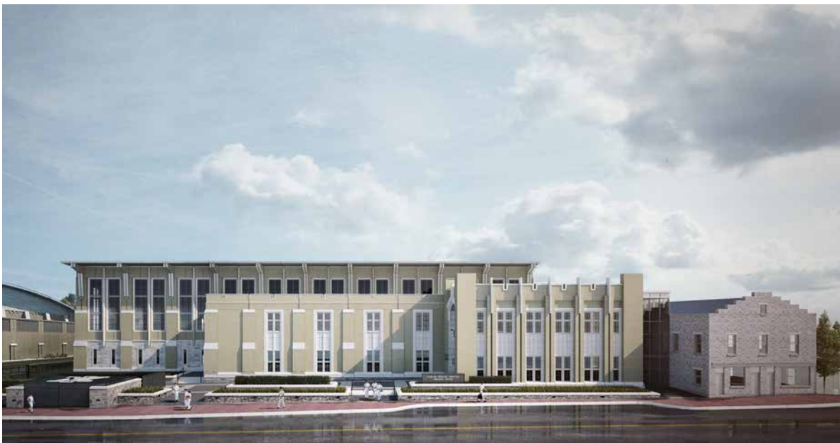
The aquatic center will be built along North Main Street, connecting to both the Corps Physical Training Facility and the Knights of Pythias building.

State funding—about three-quarters of total cost of the $44.2 million facility—was included in the biennial budget proposed by Gov. Ralph Northam '81,