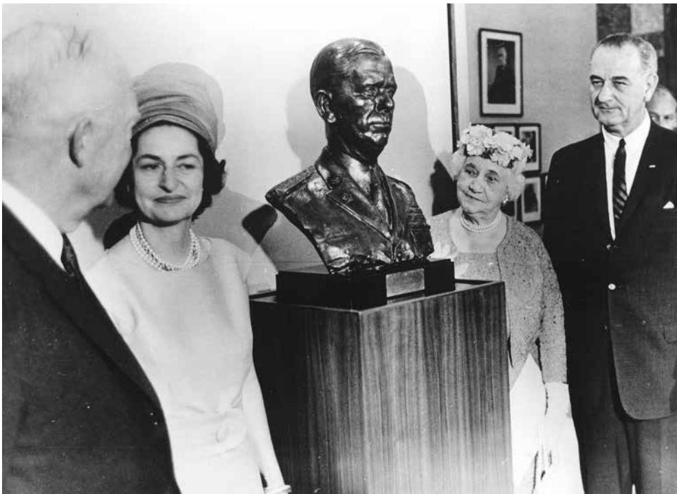
Former President Dwight D. Eisenhower and Mrs. Eisenhower, along with President Lyndon B. Johnson and Mrs. Johnson, visit the Marshall Museum during its May 1964 opening.

In addition, the Foundation plans to continue its Legacy Lecture Series focusing on the life of Marshall and the times in which he lived, and add new programs for Foundation members. A nascent initiative will be to develop distance learning programs for students that highlight Marshall's example and