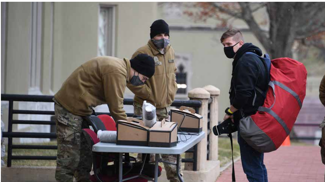
Cadets check in to move their things back into barracks after Christmas furlough. Cadets received brightly colored bracelets to indicate their COVID-19 test results.

This semester has brought with it, though, an increase in the percentage of classes being offered in person. For spring 2021, 64 percent of classes are being offered in-person, with 22 percent hybrid and 14 percent online. During the fall semester, 44 percent of