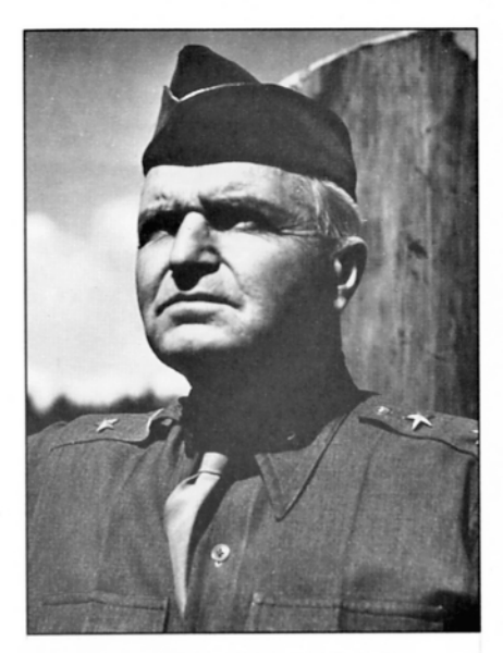
Maj. Gen. (later Lt. Gen.) Simon B. Buckner '06, USA