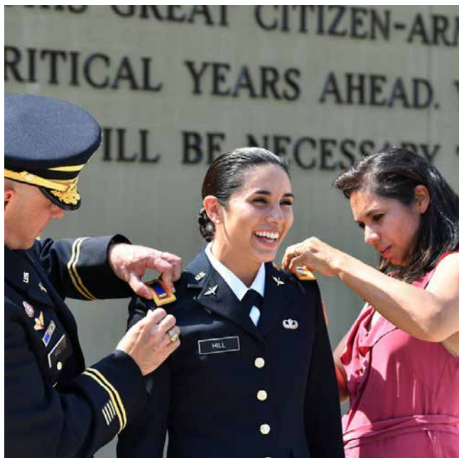
An English major is all smiles as family members affix her shoulder boards during the spring commissioning ceremony.