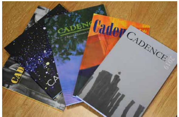
VMI's cadet-led creative arts journal, Cadence, annually publishes poetry, fiction, non-fiction, visual arts, and photography. Awards are given for the best work in each genre.