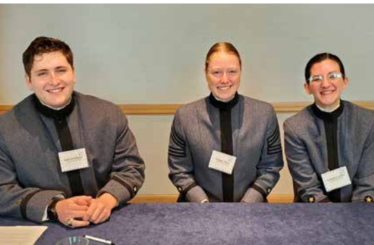
Cadets present their research on Shakespeare at the conference of the South Atlantic Modern Language Association.

The English curriculum honors longstanding scholarly traditions while also recognizing the proliferation of new modes of communication in the 21 st century. All English majors take courses in British and American literary traditions, rhetorical traditions, and ethics. These classes explore foundational texts, ideologies, and ways of considering the world that remain fundamental to contemporary citizenship and intellectual engagement. At the same time, the department prepares cadets for flexibility and adaptability within the ever-changing digital landscape of modern communication. In courses such as Digital Rhetorics and Technical Communication, cadets create and share ideas across multiple platforms, including interactive digital presentations and multimedia video essays. English majors are required to prepare an electronic portfolio of coursework throughout their cadetship, an opportunity for them to showcase traditional written work and more modern media forms.