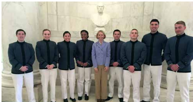
Members of the Pre-Law Society and ERHS faculty mentors visit the Supreme Court in Washington, D.C.

Research conducted as part of an independent Fieldwork course, a social media and communications internship at the George C. Marshall Foundation, is presented at VMI's Undergraduate Research Symposium.