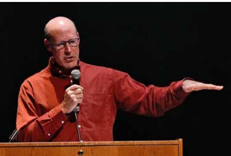
Distinguished scholars and creative writers give presentations.