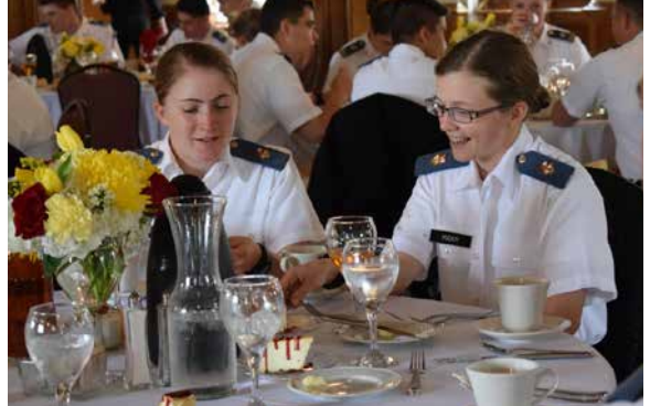
English majors socialize at departmental gatherings.