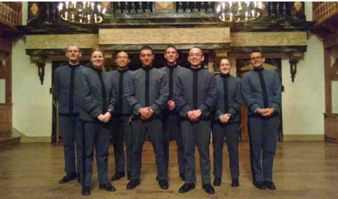
Cadets attend performances at the American Shakespeare Center's Blackfriars Playhouse.

English majors at VMI take advantage of a variety of exciting extracurricular opportunities sponsored by the ERHS department.