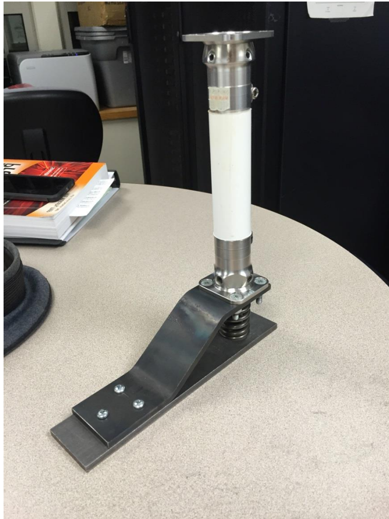
Figure 2: Completed prosthetic limb without the socket.

The process to build this prosthetic limb was relatively short and simple compared to that of modern prostheses. The final product is displayed in Figure 2, shown below.