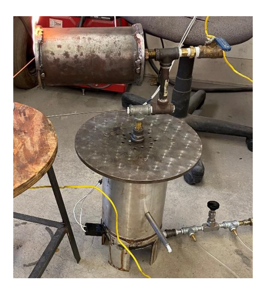
Figure 1. Final Design of Reactor

The first step in my design process was to design a functioning reactor. A picture of the final design, and a schematic of the reactor can be seen in Figures 1 and 2, respectively. Once the reactor was built, temperatures at key points were taken within the system; these points were the reactor exit, the combustion chamber, and the exit exhaust. Using a differential pressure gauge, I was able to measure the flowrate of compressed air entering the system. This would prove critical in my ability to calculate molar flowrates to determine the heat gain of the system.